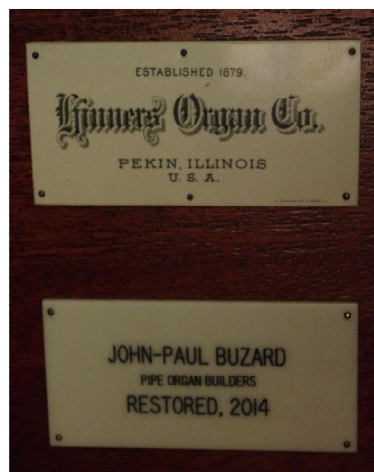
Name plates on the organ console.

Response regarding this extensive project is both positive and enthusiastic. Parishioners at St. John's had many questions to ask, interest in each step of this process, anticipation in finally having the organ back again, and great satisfaction (and some surprise) in the final result. Having an organ restored is a major project, but the result makes the expense worthwhile and helps to ensure the instrument's further use and the ability for its musical sounds to be enjoyed by many for years to come.